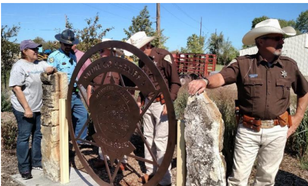
Figure 1 NAACP Block Party. Figure 2 & 3 Sheriff's Mounted Patrol Open House